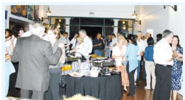
Guests enjoyed delicious snacks after an entertaining and informative talk.