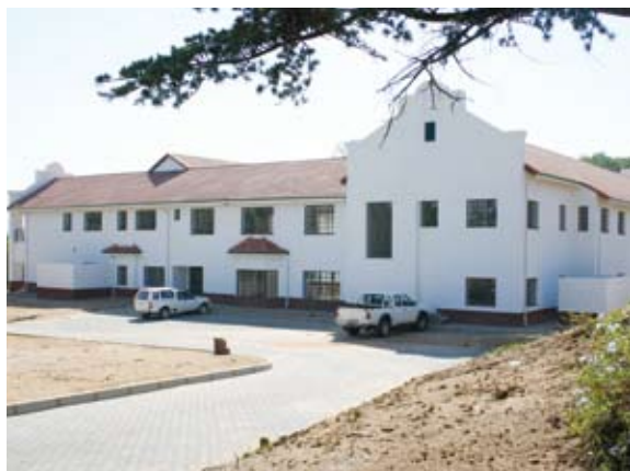
The new boarding house

One development that the School is excited about is the completion of a new boarding house.