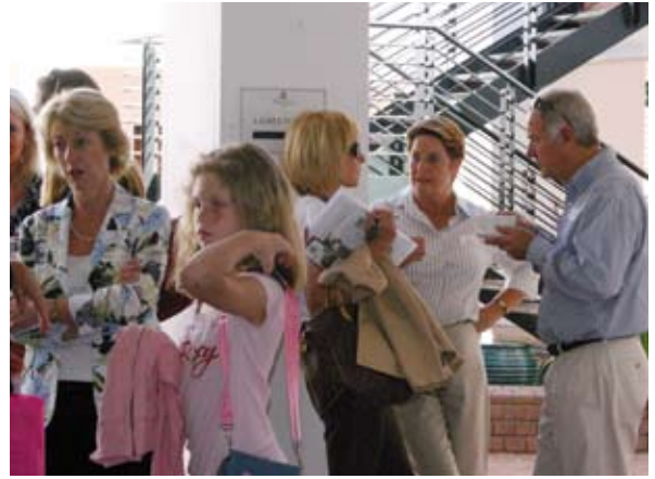
Outside the Allister Rogan Auditorium, guests discuss the role of the Old Girls in raising funds for the school

A number of Old Girls have undertaken to act as class representatives and are making contact with their peers to tell them about the Foundation and encourage them to make a small monthly contribution to the Endowment Fund. Foundation staff and governors recently met the first cohort of 32 “ambassadors” and we thank them for interest and enthusiasm. Support from within the school community is vital to the success of the Heritage Foundation and if there are other Old Girls out there who can play a part in this project, the Foundation would be very pleased to hear from you.