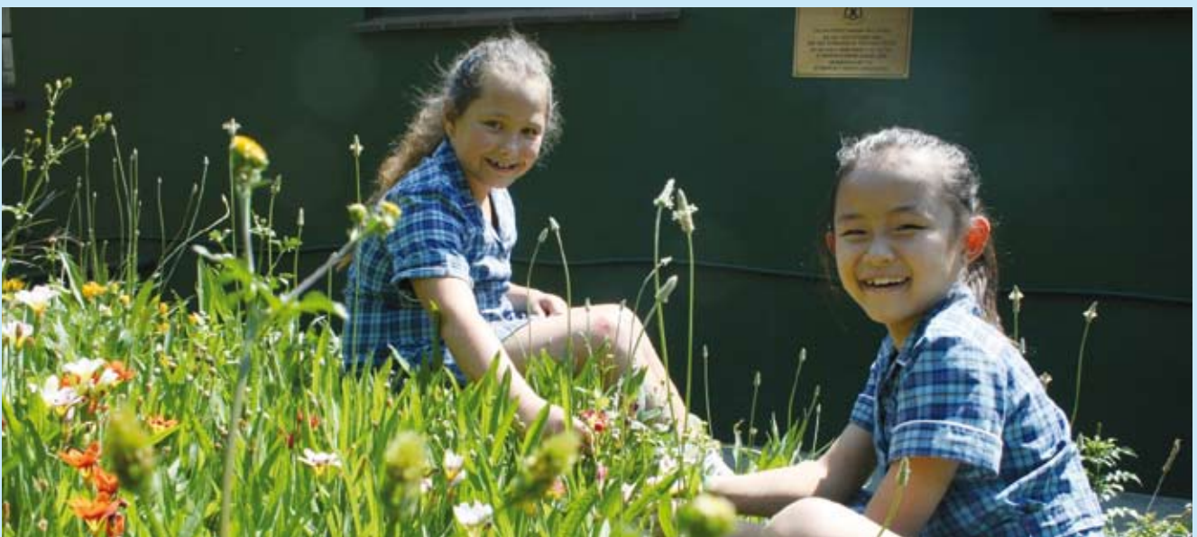
Grade Two learners in the recently established Junior School butterfly garden