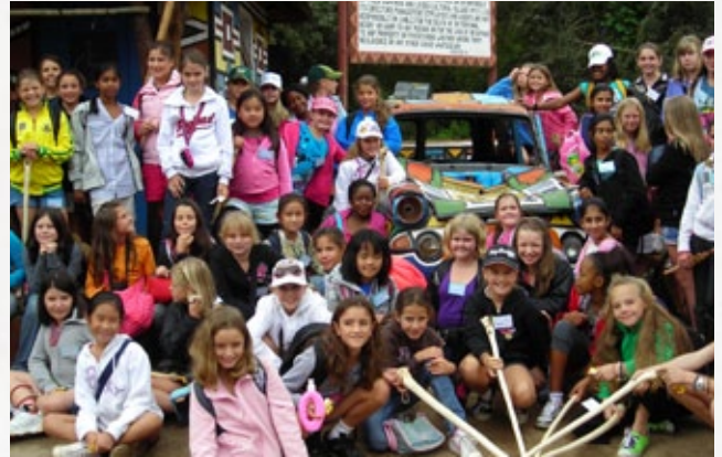
Visit to Lesedi Village