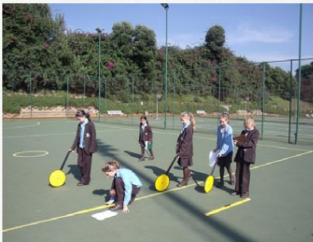
Practical Maths lesson