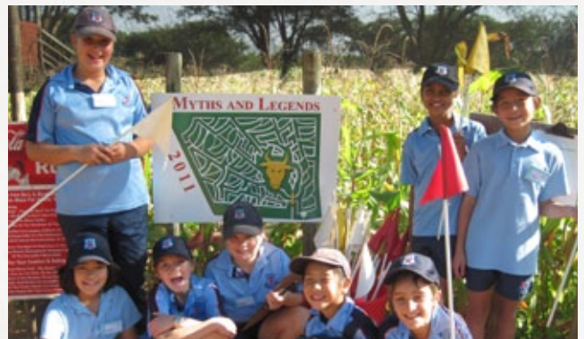
Honeydew Maze visit

The grade 5s have been studying Genealogy. They created their own family trees using any medium they preferred from decoupage trays, scrapbooked journals, wire trees to painted masterpieces! In their oral presentations, they enjoyed sharing grandfather's war-stories, granny's favourite sayings and mommy's childhood memories, to mention only a few!