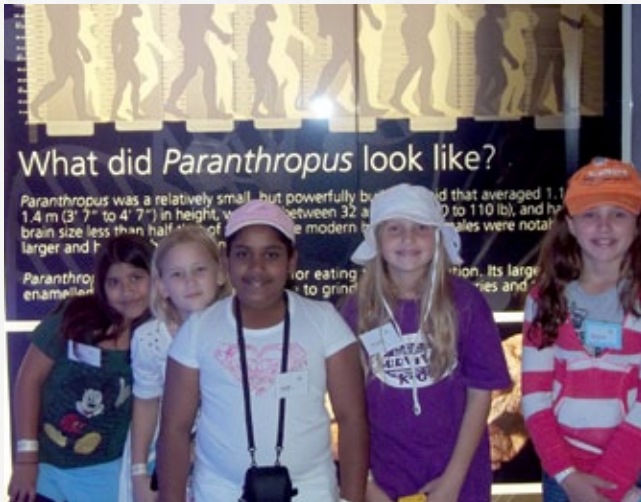
Outing to Maropeng