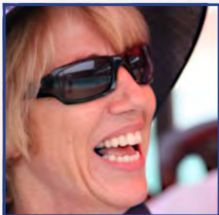
A delighted spectator at Interhigh