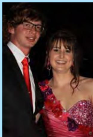
The rains could not spoil the much-awaited matric dance. The dance committee are to be congratulated on arranging a wonderful 'Greek' evening for the matrics. The marquee was beautiful and the girls looked stunning in their colourful dresses.