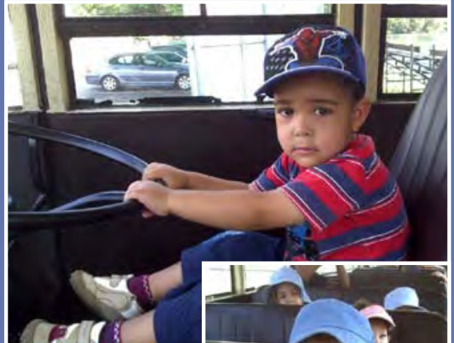
The three year olds enjoyed singing songs on the school bus.