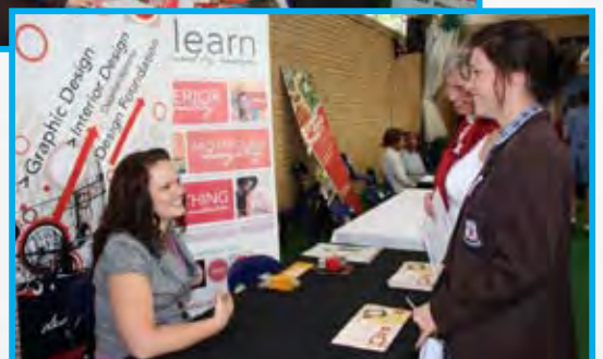
We combined with St Benedict's to host a Careers Expo for our students.