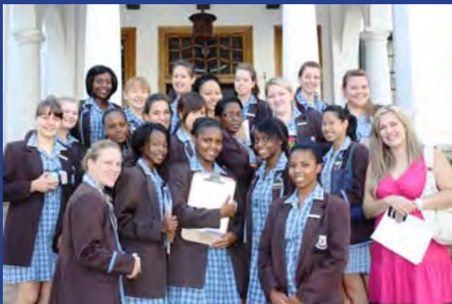
The grade 12 Accountancy class were each assigned a shop in the Mall of Rosebank to audit. They spent time interviewing employees and auditing the shops' financials and stock.